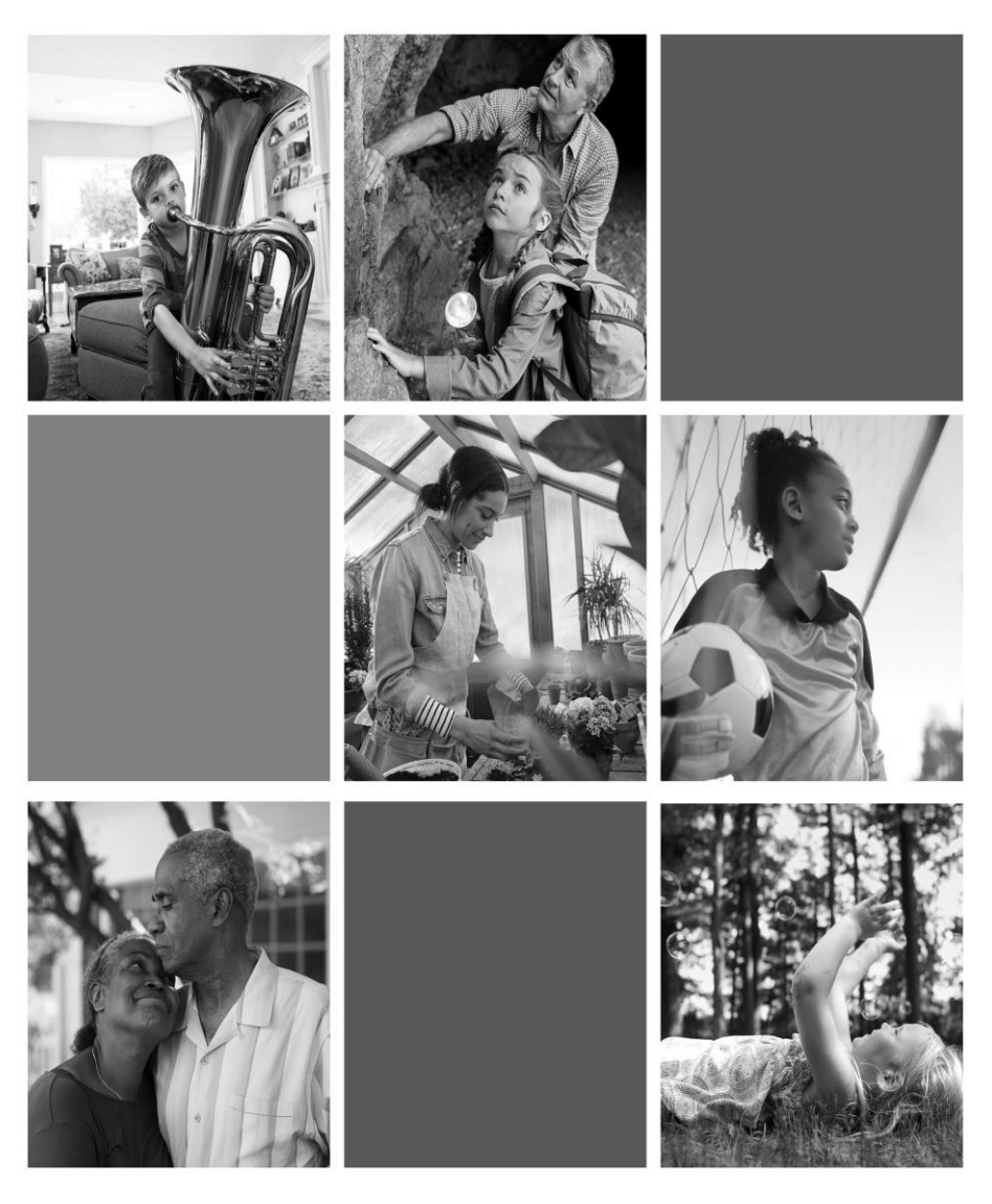
Your Health Care Benefits Program